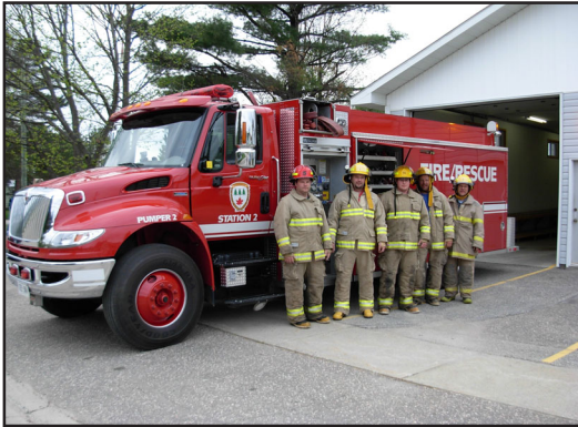
FIRE STATION 2 - TROUT CREEK

The Municipality of Powassan, with its population of 3200, is blessed with many natural advantages for both residents and businesses. We have municipal leaders and staff dedicated to provide economic leadership and a vision to grow Powassan as a community that offers a great and affordable quality of life.