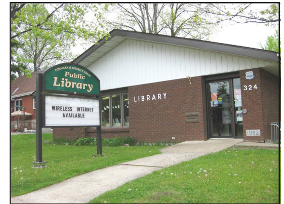
POWASSAN & DISTRICT UNION PUBLIC LIBRARY

There are many places of worship located throughout our community.