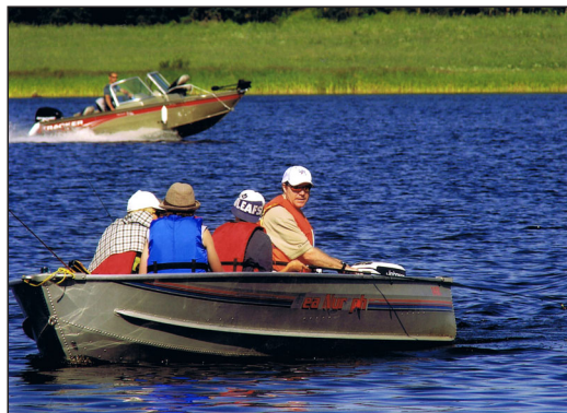
FISHING ON A LOCAL LAKE

The Municipality of Powassan has a municipally owned Medical Center with two doctors, a dentist, a physiotherapist, massage clinic and chiropractic services. Two full facility nursing homes are within the municipality. We have two elementary schools in Powassan and