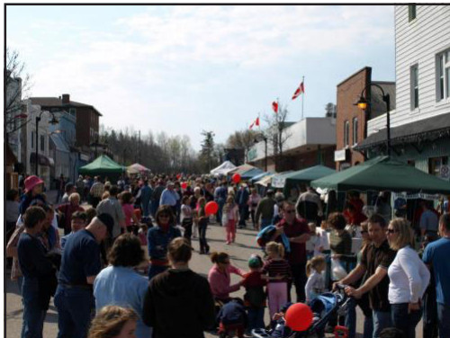
MAPLE SYRUP FESTIVAL