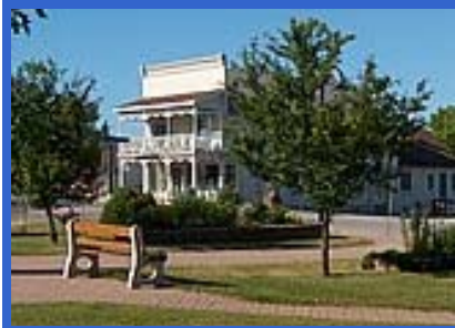
Veterans Memorial Park