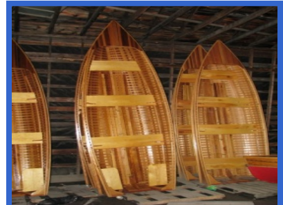
Giesler Cedar Boats

466 Main Street PO Box 250 Powassan ON P0H 1Z0 (705) 724-2813 info@powassan.net www.powassan.net